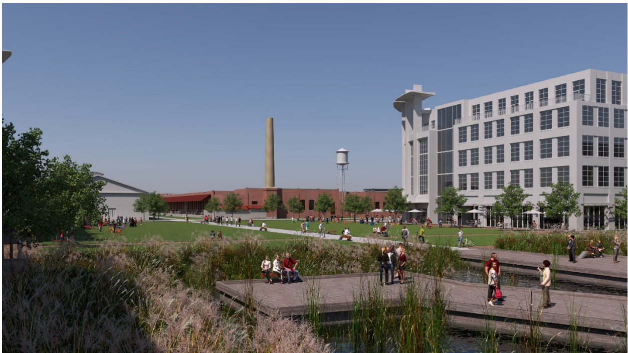
(Interior Campus Rendering of the Intersect East Campus, courtesy of Elliott Sidewalk Communities)