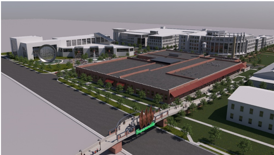
(Aerial Rendering of the Intersect East Campus, courtesy of Elliott Sidewalk Communities)