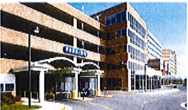
Forsyth Medical Center North Pavilion Tower & Parking Garage