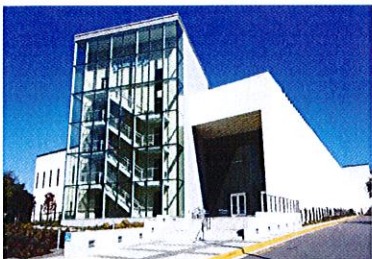
Laboratory Corporation of America